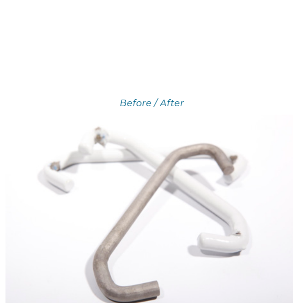
Before / After